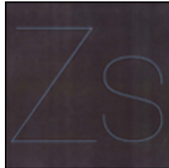
Zs 10" vinyl Ricecontrol 10 Ricecontrol Records