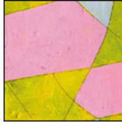
Karate Bump PR024 Planaria Recordings