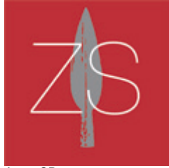
Arms CD PR029 Planaria Recordings