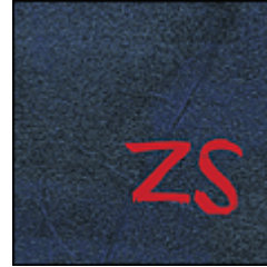
Zs s/t CD TMU117/Vothoc 001 Troubleman Unlimited