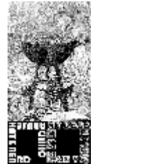
Zs/Child Abuse 7" split ZUM Records